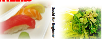
Sushi for Beginner