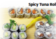
Spicy Tuna Roll