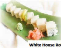
White House Roll