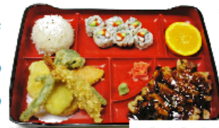
Bento Box A