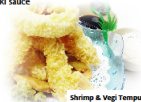
Shrimp & Vegi Tempura